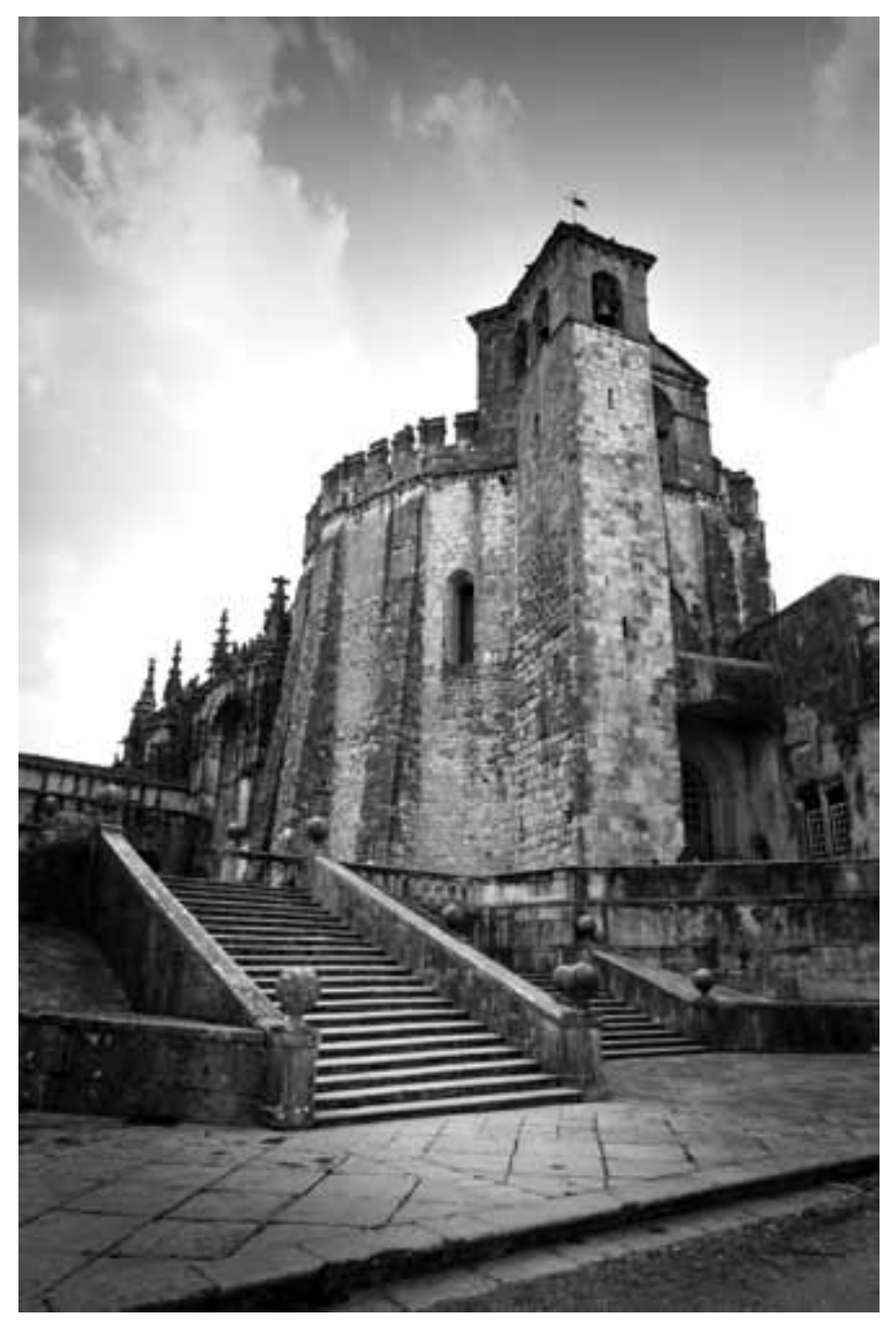
The rotunda, Tomar.