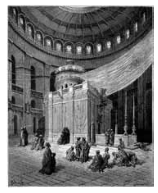
Church of the Holy Sepulcher.

and cathedrals throughout Europe, particularly those erected above pre-existing ancient temples, where identical rituals were once performed. Some are well known: Chartres cathedral, Mont St. Michel, Roslin Chapel, and so forth. In Egypt there is a narrow, claustrophobic chamber beneath the temple of Dendera decorated with one-of-a-kind reliefs depicting a kind of rebirthing process. Just to the west, the Chapel of Osiris in Abydos contains a mural depicting the same ceremony in graphic terms, while in the adjacent Osirion an underground temple made