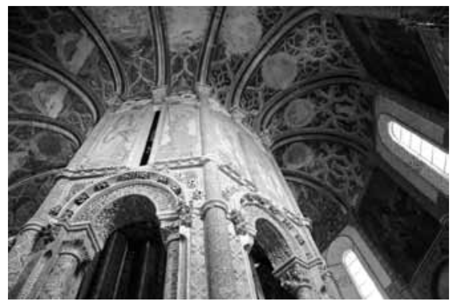
Interior of the rotunda. The decor was added four centuries later.