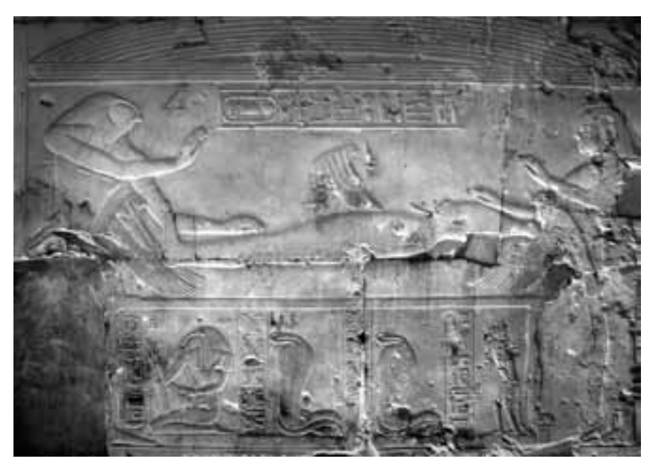
Resurrection ritual. Abydos.