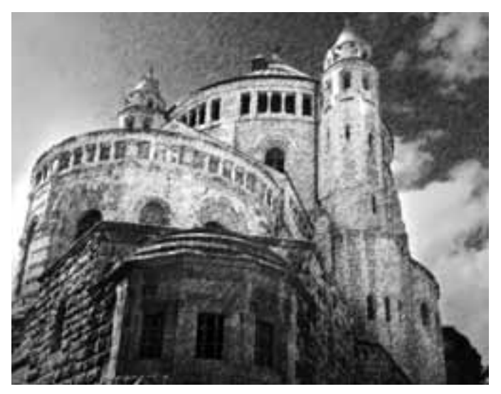
Abbey de Notre Dame du Mont de Sion

Whatever went on inside the abbey's compound it was conducted within a perimeter built more like a fortress than a church and pursued with utmost conviction, tenacity and secrecy,<sup>69</sup> as though the Ordre de Sion was engaged in some crucial yet undisclosed plan, to all intents and purposes behaving like a secret society pursuing a holy grail.