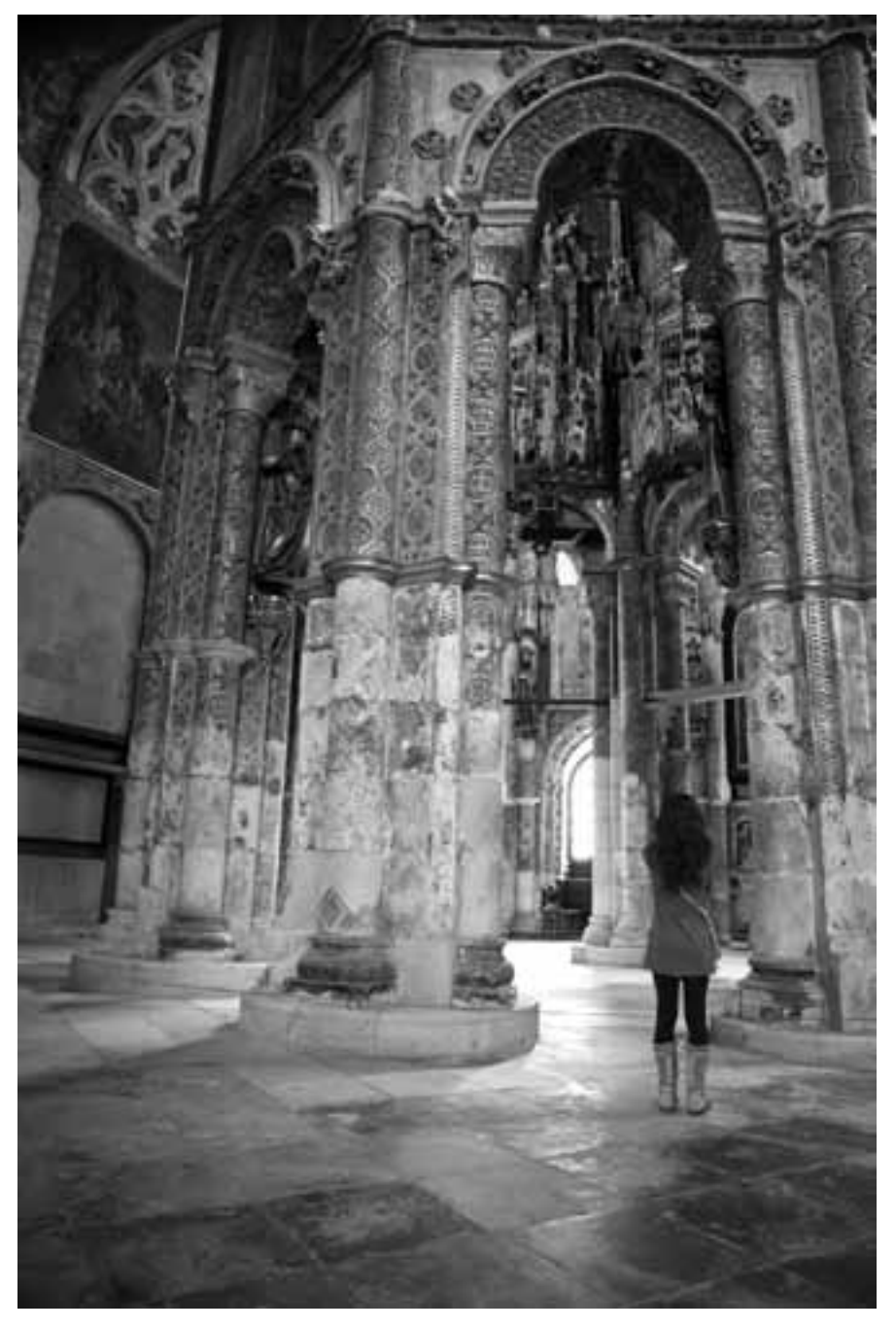
Interior of the rotunda.