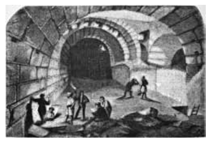
Tunnels beneath Temple Mount.

Without question, the Templars had dug their way to the most sacred parts of Jerusalem — the church of the Holy Sepulcher, the es Sakhra of the Muslims, the Shetiyya of the Jews — the very foundation stone of the sacred mount where Solomon's Temple had once stood. But what specifically had they been looking for and how had the Templars known where to dig?